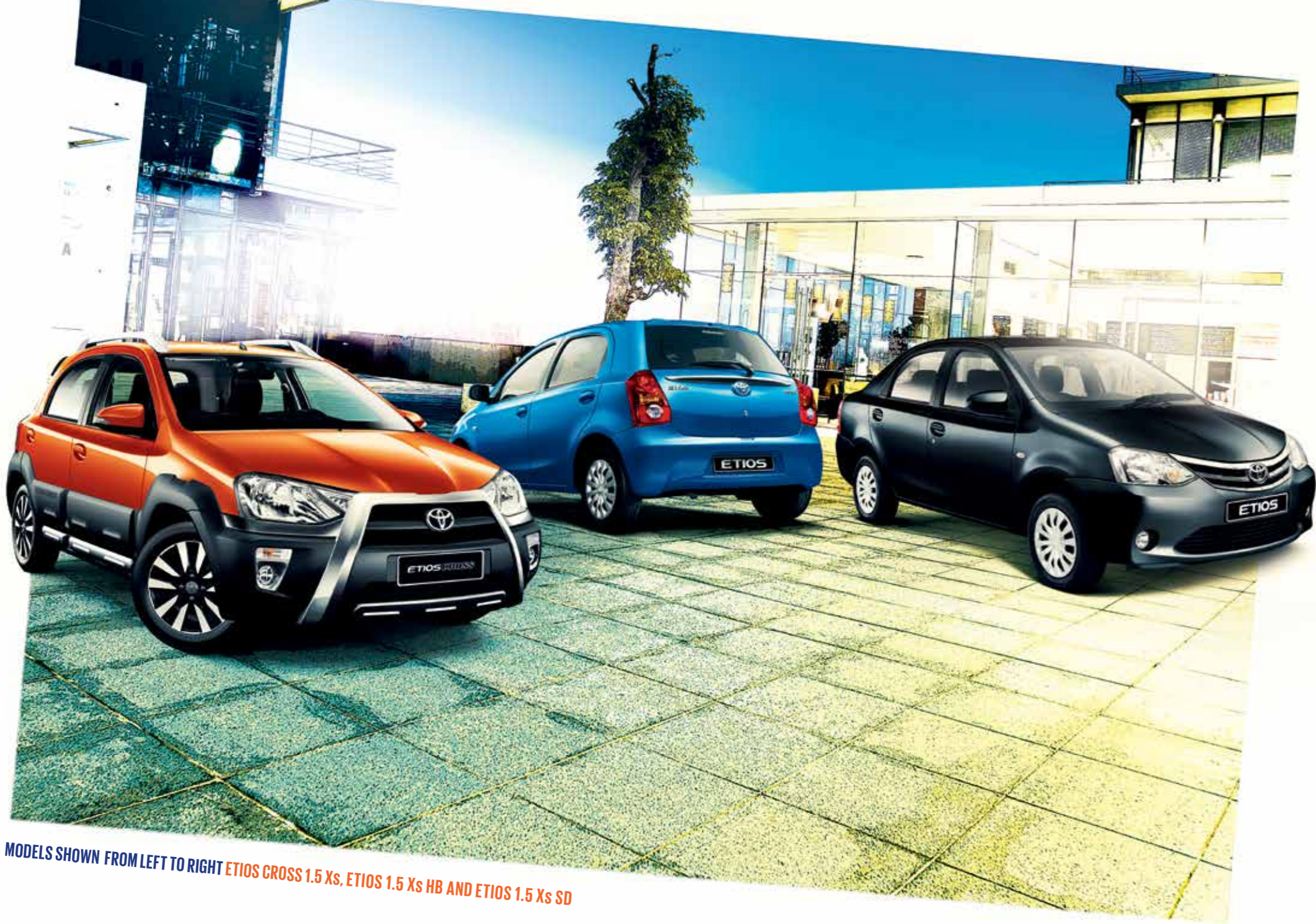
MODELS SHOWN FROM LEFT TO RIGHT ETIOS CROSS 1.5 Xs, ETIOS 1.5 Xs HB AND ETIOS 1.5 Xs SD